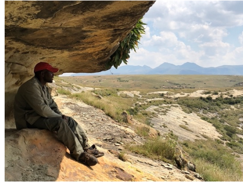
View from the sunset cave

At the top, cross some barbed fences. The sunset cave can be reached a bit later on the left.