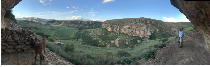
View from the small cave

10. At the next junction , you can go left (steep climb) to the small cave (good rest spot), then continue from the cave up to Cottage Goji.